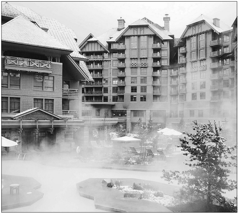
The Four Seasons Resort in Whistler, B.C. has an exceptional outdoor pool, heated year-round, and specialized Mountain Men spa treatments.