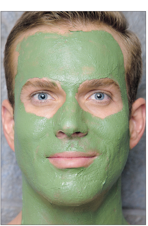
GRAND RESORT & SPA