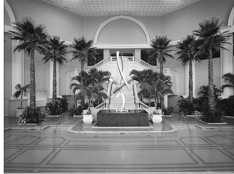
Borgata Hotel Casino & Spa in Atlantic City, N.J. is home to SpaToccare and The Barbershop, a stylish men's sanctuary